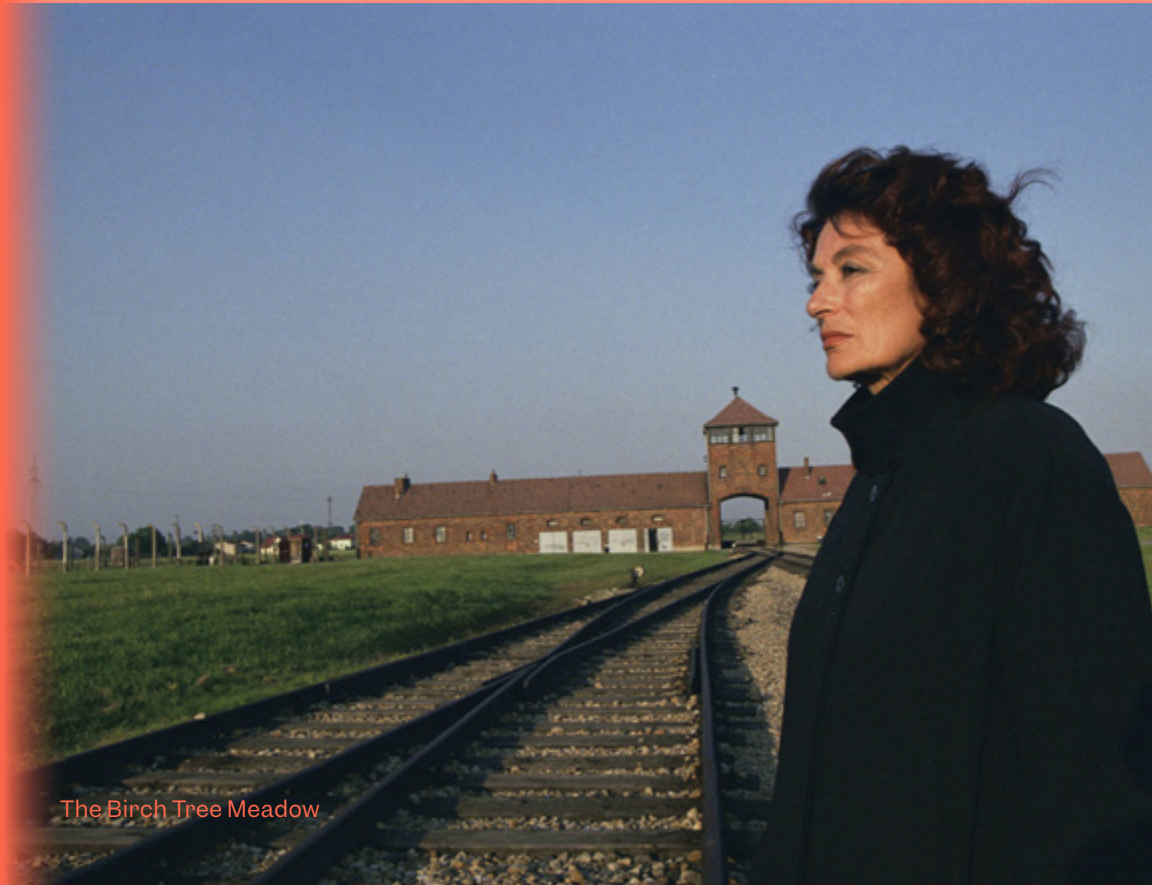
The Birch Tree Meadow