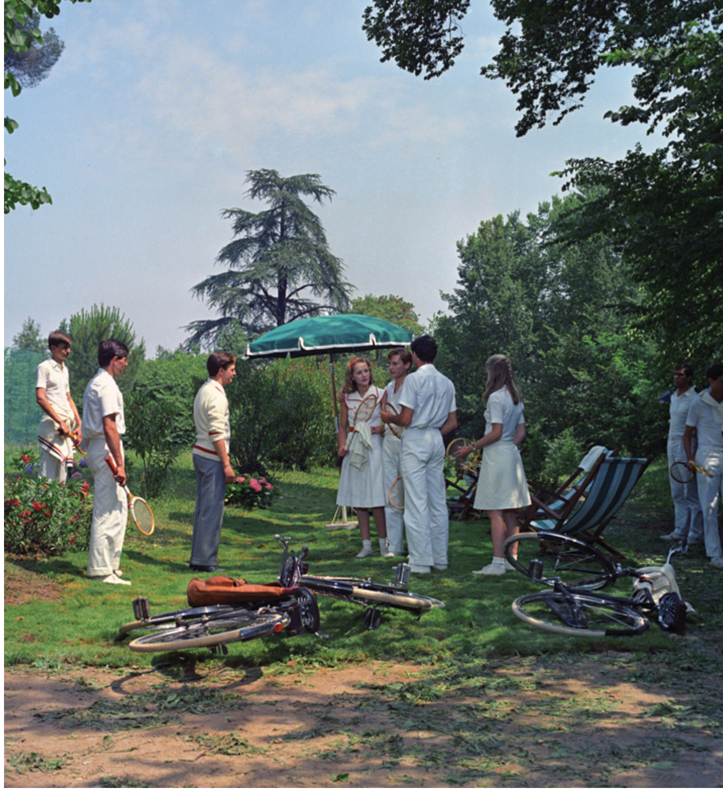
Above: The Garden of the Finzi-Continis; Cover: The Birch Tree Meadow