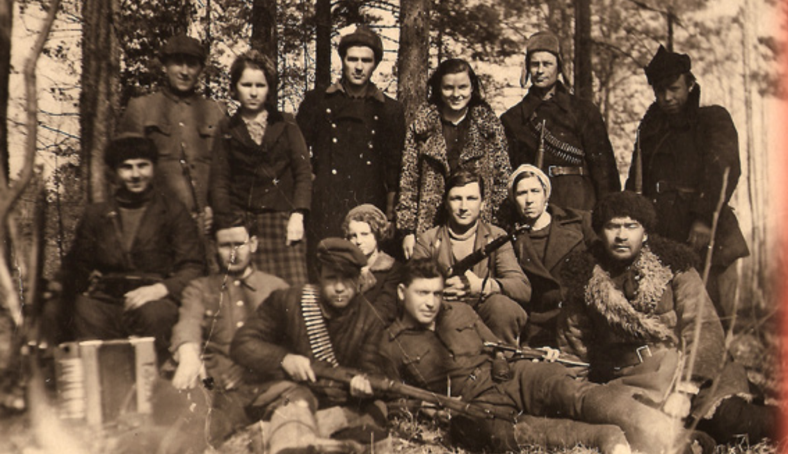
Four Winters: A Story of Jewish Partisan Resistance and Bravery in World War II