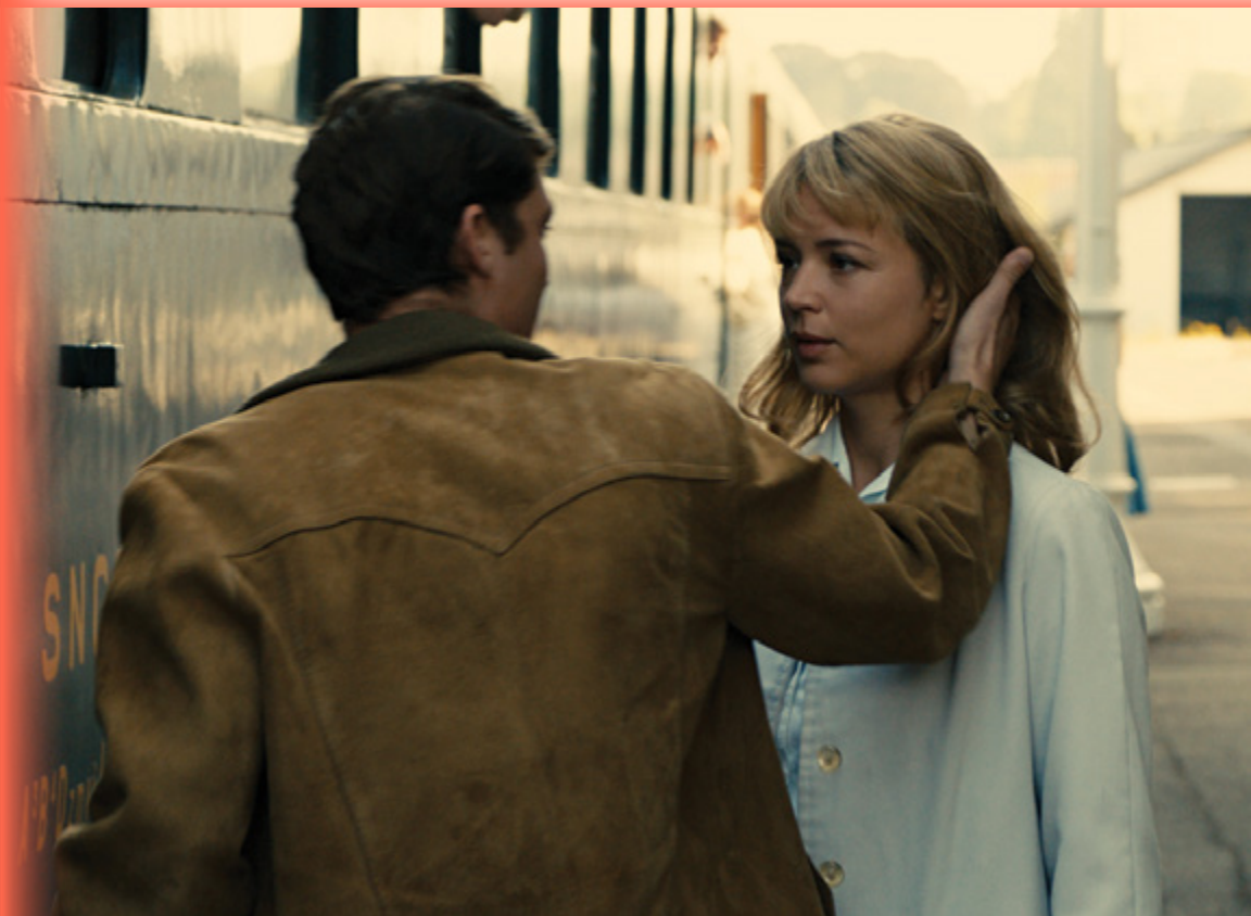
An Impossible Love

A concert pianist from a respected musical family with the dream of raising a musical prodigy is devastated when her son is born deaf. When she doubles down on her expectations for him, her obsession threatens to crush her child.