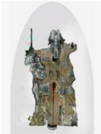
Panel #3 , 2022, from the series Queendom , 2022. Inkjet print.