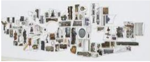
Shifting Degrees of Certainty , 2014, from the series Implicit Manifestation , 2014. Inkjet prints with audio. The Museum of Modern Art, New York, Fund for the Twenty-First Century