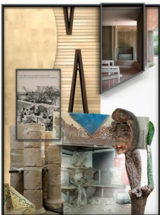
Vitrine No. 7: Cover story , 2017, from the project No Thing Dies , 2014–17. Inkjet print, gold leaf, and frame of medium-density fiberboard. Tony and Trisja Podesta Collection, Washington, DC