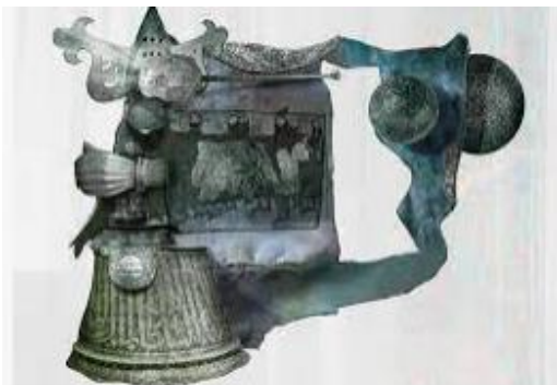
Panel #7 , 2022, from the series Queendom , 2022. Inkjet print.