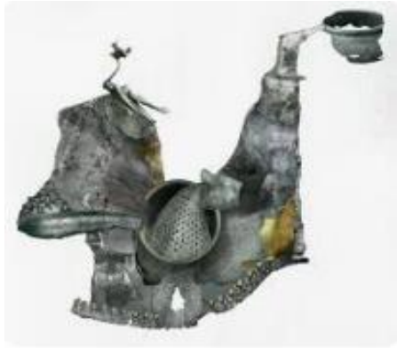
Panel #6 , 2022, from the series Queendom , 2022. Inkjet print.