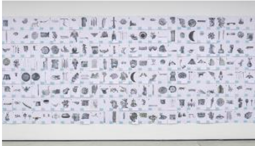
[archive / research papers]