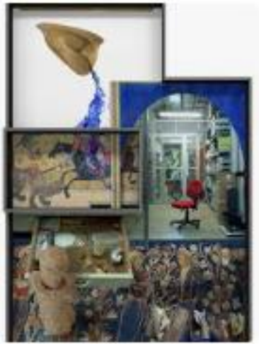
Vitrine No. 11: On the most beautiful thing in the world , 2017, from the project No Thing Dies , 2014–17. Inkjet print and frame of medium-density fiberboard.