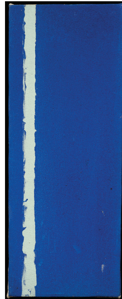
Barnett Newman, Untitled I , 1955. Oil on canvas. Jewish Museum, New York, gift of the Barnett and Annalee Newman Foundation, 2018-35